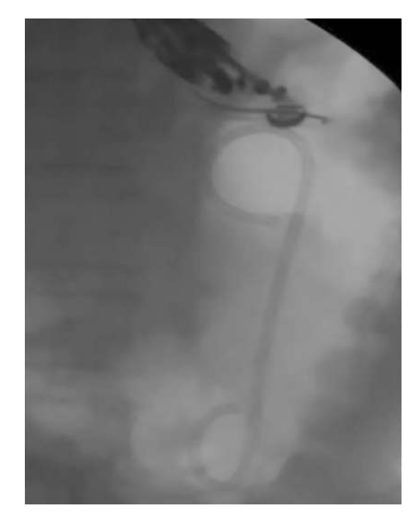
Fig. 6 Fluoroscopic images of deployment of a double pigtail 10 Fr stent across the fistula created

(SBDC-10 or 11; Wilson-Cook) or a 10 Fr cystenterostome (EndoFlex, Voerde, Germany) before deployment of a double pigtail stent (Fig. 6).