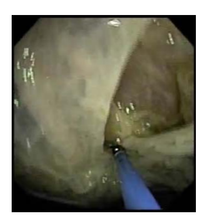
Fig. 7 Debridement during necrosectomy with a rat tooth forceps

As described by Baron et al. [12], transmural drainage is the preferred approach for these collections. After entering the collection, the gastric or duodenal wall is dilated to 15 mm to allow a wide diameter for the solid material outflow around the endoprostheses (generally two 10F stents). A 7F irrigation tube is placed into the collection for aggressive irrigation of the solid debris. Initially, up to 200 ml of normal saline is forcefully and rapidly infused via the tube every 2-4 h. If the patient is intolerant of the standard nasobiliary tube, an alternative is to place a PEG tube with placement of a jejunal extension into the collection. Pre-procedural antibiotics should be administered and patients should be admitted to the hospital after the procedure for observation and irrigation. Antibiotics and irrigation should be continued until serial imaging reveals resolution of the collection. At that point, internal drains may be endoscopically removed.