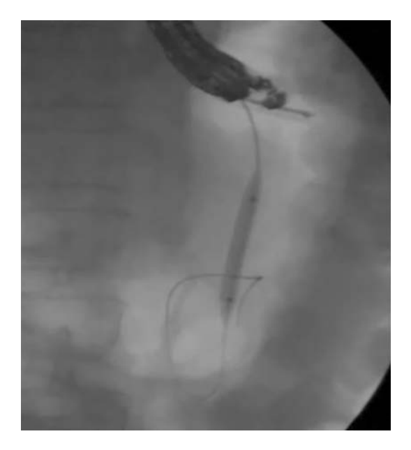
Fig. 3 Fluoroscopic image during dilation of the fistula created between the stomach and the abscess