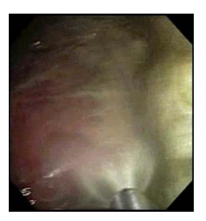
Fig. 8 Water jet lavage during necrosectomy

The procedure, as described by Seewald et al. [13] involves a more aggressive algorithm. The first session includes endoscopic transpapillary and/or transmural EUS guided access of the necrosis followed by balloon dilation of the fistula created. This is followed by daily necrosectomy, lavage, and repeated balloon dilation.