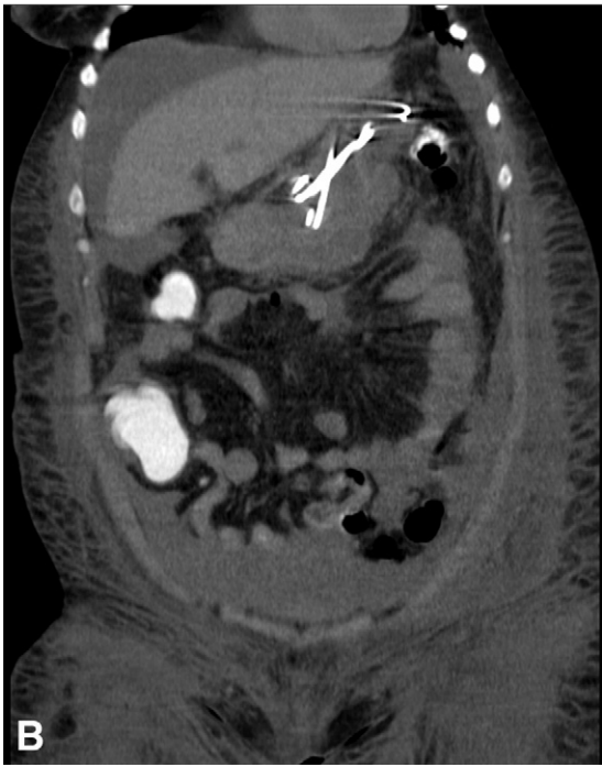
Figure 4. A, A CT of the abdomen revealing a large walled-off pancreatic necrosis. B, After drainage by the multiple transluminal gateway technique, a CT of the abdomen at 72 hours reveals marked resolution in size of the walled-off pancreatic necrosis. The multiple stents are better visualized on a coronal view.

after the initial endoscopic intervention that required supportive measures for sustenance of life. Bleeding was defined as any hemorrhagic event that required endotherapy, radiological interventions, blood product transfusion, or inpatient observation. Stent migration was defined as the need to retrieve a stent from within the walled-off pancreatic necrosis or enteral lumen.