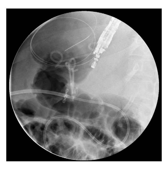
Figure 3. Fluoroscopic image revealing creation of the 3 transmural tracts in a patient with walled-off pancreatic necrosis measuring more than 150 mm in diameter.

culture in all patients, and appropriate culture-directed antibiotics were administered.