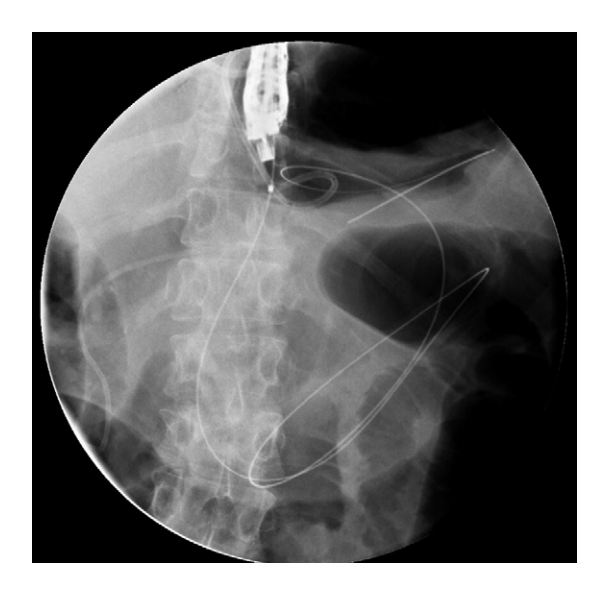
Figure 2. Fluoroscopic image revealing passage of a guidewire into a different site (site 2) in the walled-off pancreatic necrosis after initial placement of a transmural stent (site 1).